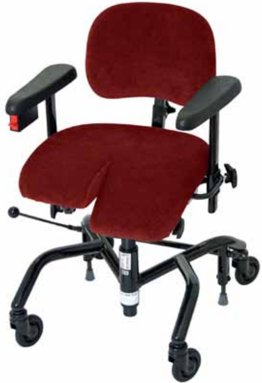
REAL 9800 PLUS COXIT EL