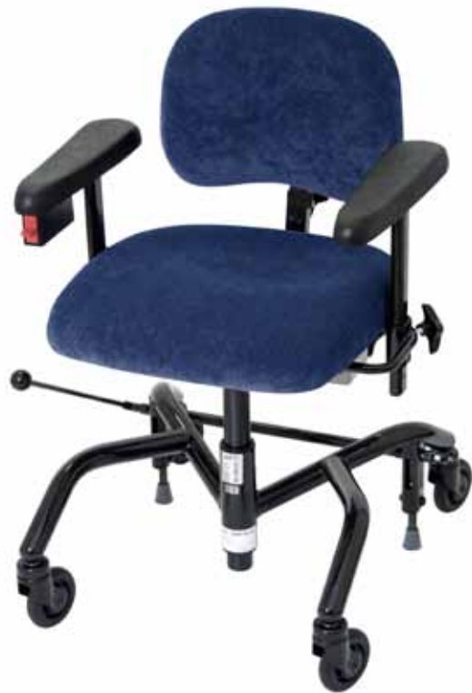
REAL 9100 PLUS EL